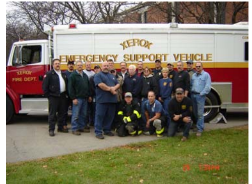
Confined space rescue training class, October 2008