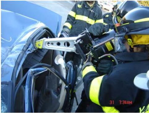
Extrication training: Opening a side, October 2008