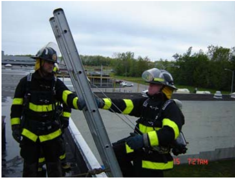
Ladder operations training: Transitioning to the roof. May 2008