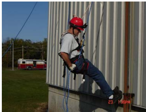
Confined space rescue rappelling