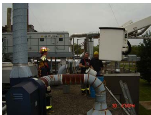
Hauling cleanup waste from the roof of Bldg. 103