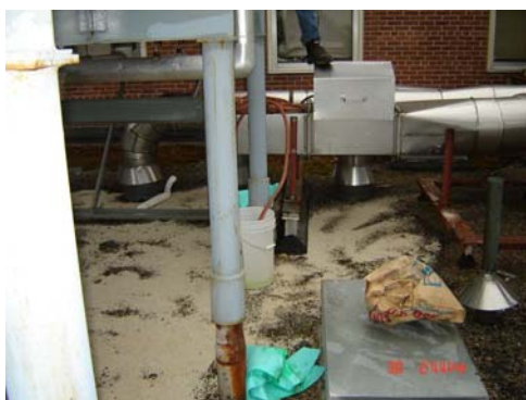
Ethylene glycol spill, Bldg. 103,

as some of the training that members attended to learn new skills and techniques or simply hone their skills.