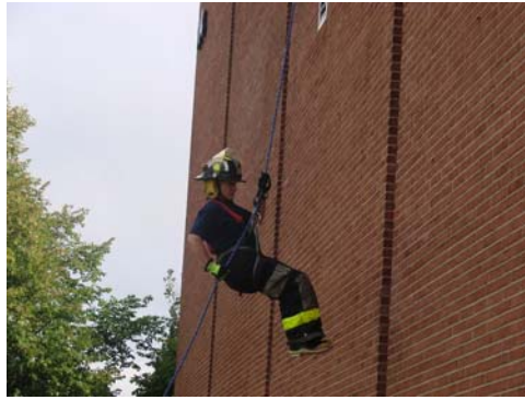
Joint training in rappelling with the Xerox Ambulance, 12 August 2008