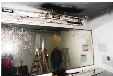
Restroom light fixture fire, Bldg. 139, 20 November 2008