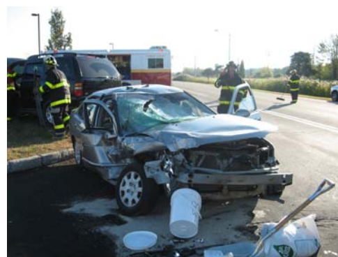
Motor vehicle crash, Bldg. 111, Dock 1, 09 October 2008