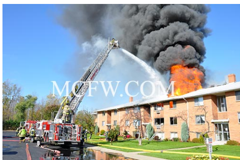
Daniel Drive fire, Webster, 23 October 2008 (Monroe County Fire Wire)