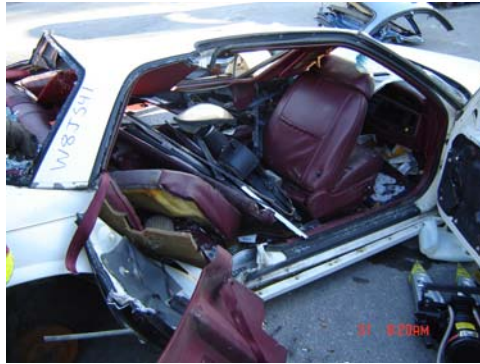
Extrication training: Making a third door, at Wilbert's Auto Parts