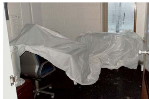
Salvaging office property at the Bldg. 139 fire