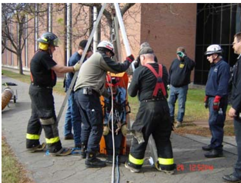
Confined space rescue